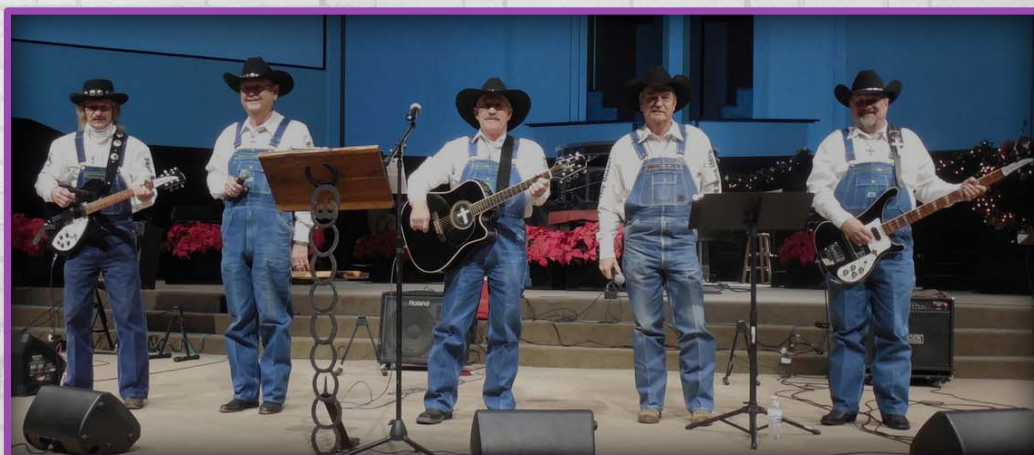
Baggy Bottom Boys