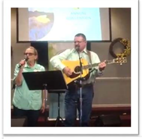
The Milburns Joyful