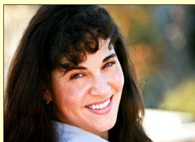
STGMA Gospel Soloist from San Antonio, TX

SATURDAY - APRIL 13 - 6 PM IMMANUEL BAPTIST CHURCH