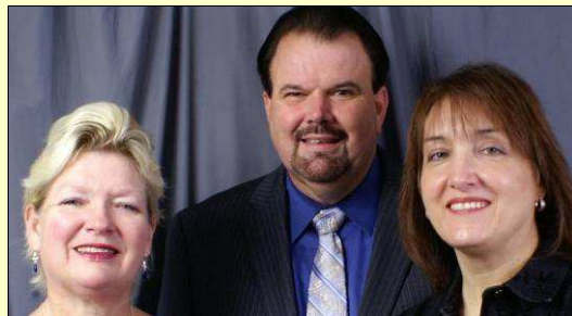
STGMA Southern Gospel Trio from Brazoria, TX